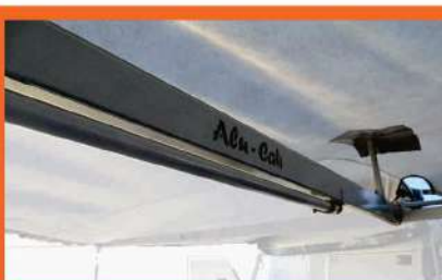
Drop down leg