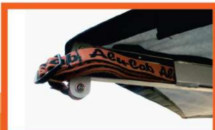
Tie-down strap in arm